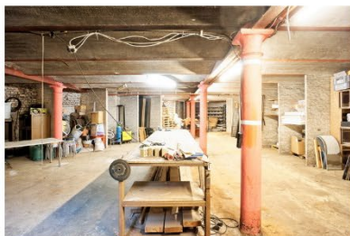
R-1 : Basement, Workshop space