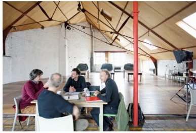
R+3 : Studio