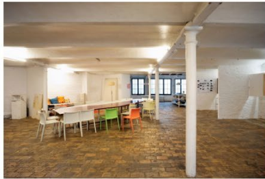
R+1 : Common space, kitchen