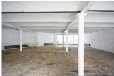
R0 : Ground floor